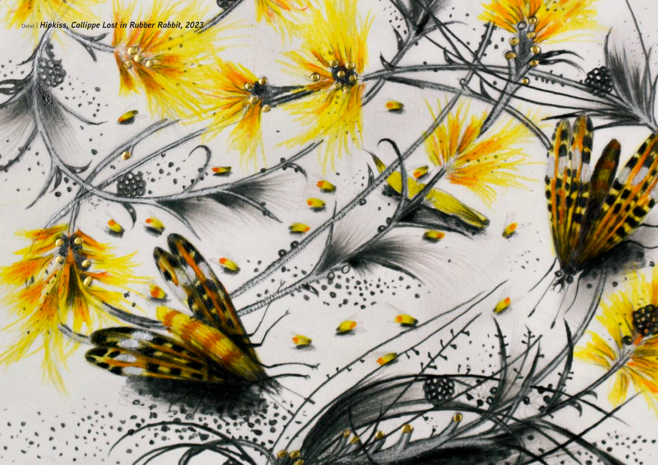
Detail | Hipkiss, Callippe Lost in Rubber Rabbit , 2023