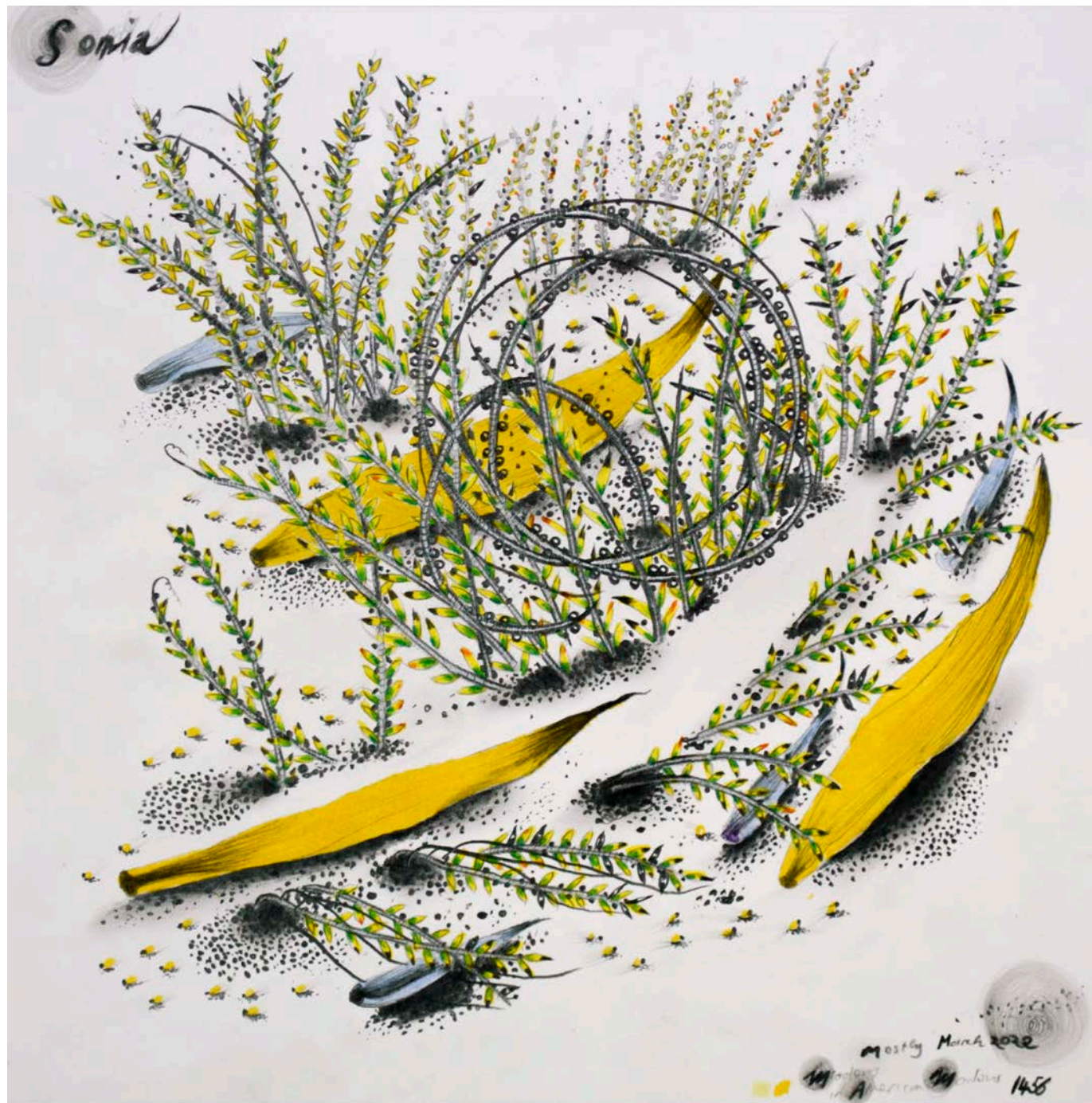
Hippiess Meadows in the American Meadow, 2023 Graphite, silver ink, metal leaf and colored pencil on Fabriano 4 paper 25 x 25 cm | 9 3/4 x 9 3/4 in